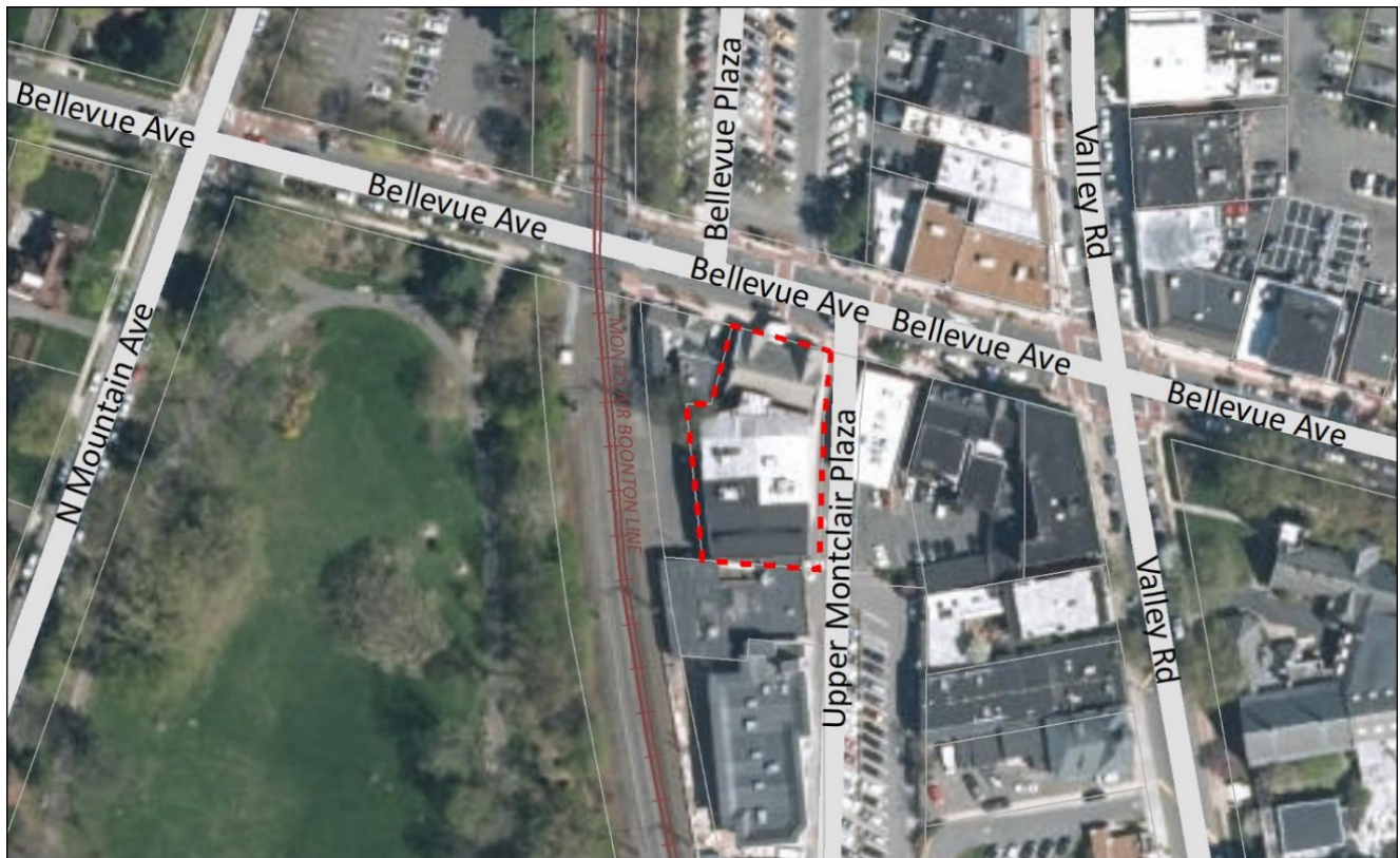
Figure 2: Aerial view of subject property.

The subject property is located on the south side of Bellevue Avenue adjacent to the access driveway to the Upper Montclair Plaza parking lot as shown in Figure 2. The subject property is a corner lot that is 12,689 square feet in size with 72.2 feet of frontage along Bellevue Avenue and 160 feet of frontage along the driveway to the parking lot. It contains a historic building comprised of a front 2-1/2 story building that historically contained retail stores and the theater lobby attached to a larger two-story building that contained the theaters. Most recently while operating as a theater, the building had 885 theater seats in 4 theaters and 5,000 sq. ft. of personal service retail space and no onsite parking. The building has been vacant since 2017.