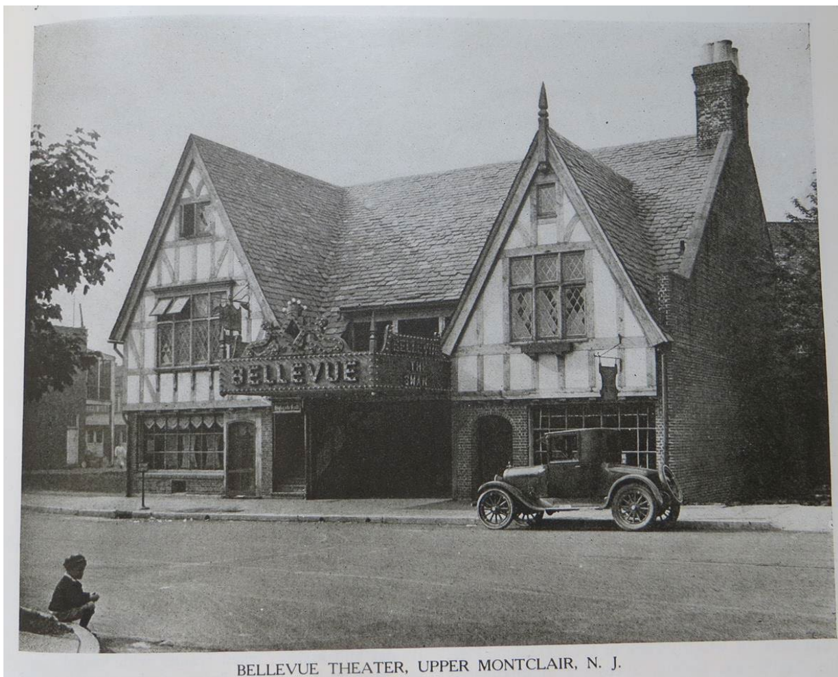
Figure 8: Photo of the subject property in 1923.

The Bellevue Theatre is a key building in the Township's Upper Montclair Historic District and plays an important role in the long-term vitality of the Upper Montclair business district. The Tudor-Revival theater building was constructed in 1921 and designed by architect J. H. Phillips. The original design included retail storefronts along the Bellevue Avenue frontage. It was originally built by the Anderson family, who donated the land for what is now Anderson Park, at a time when masonry buildings were replacing wooden-frame buildings in Upper Montclair's center. The building complemented the Tudor village theme that was taking shape in the area in the buildings along Valley Road between Bellevue and Lorraine Avenues, including the former Upper Montclair Post Office (now Coldwell Banker) which was several buildings to the east of the theater.