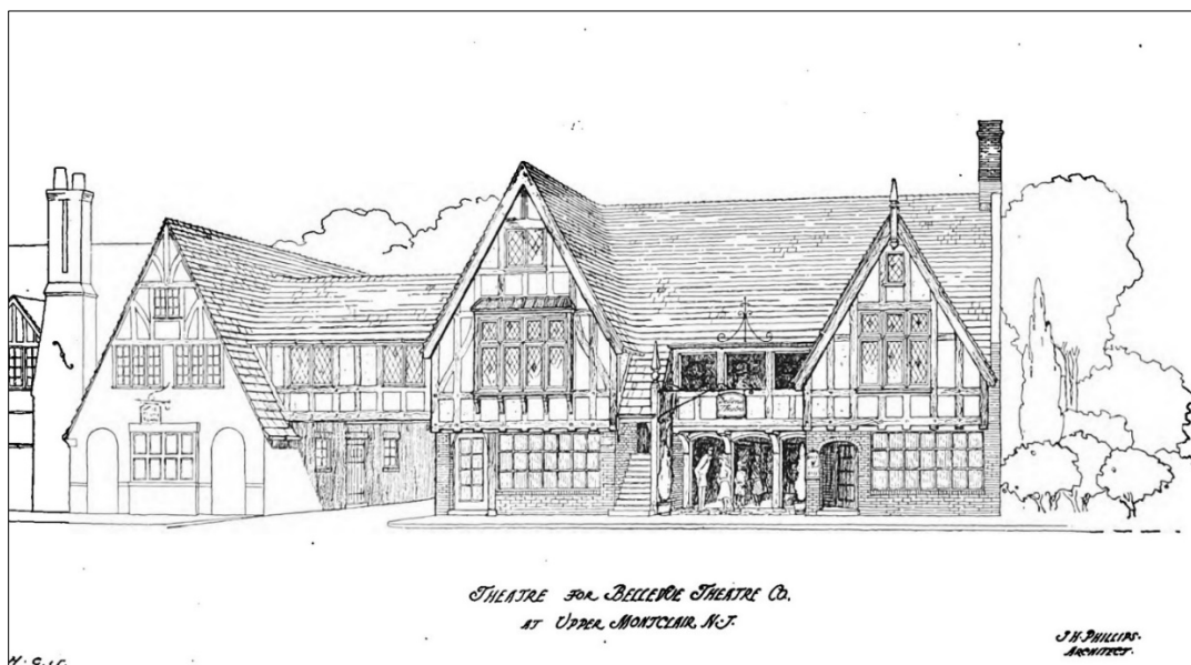
Figure 9: The Architectural Forum. June 1925. 411

The Bellevue Theatre operated at this location for 95 years before it closed in 2017. The theater offered a variety of amenities, including a second-floor restaurant called Highgate Hall and an orchestra pit. It was converted into a three-screening-room theater in 1983; a fourth was added in 1997. By the time it closed, one of the two storefronts embedded in it had been taken over by the theater for the expansion of the concession stand.