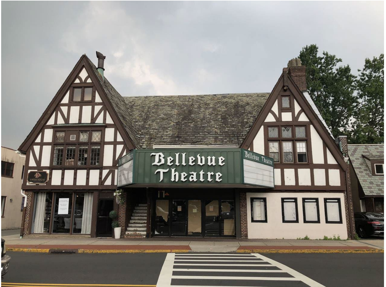
Figure 3: View of subject property from Bellevue Avenue.

The portion of the building that fronts on Bellevue Avenue, as shown in Figure 3, previously contained the theater lobby and a hair salon. It also contains a large marquee sign that identifies the entrance to the theater.