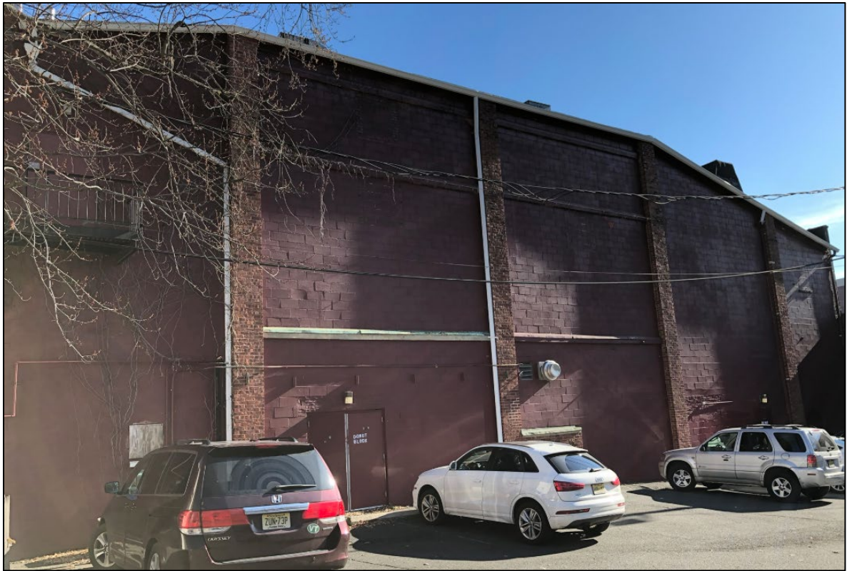
Figure 7: View of western building façade of the subject property.