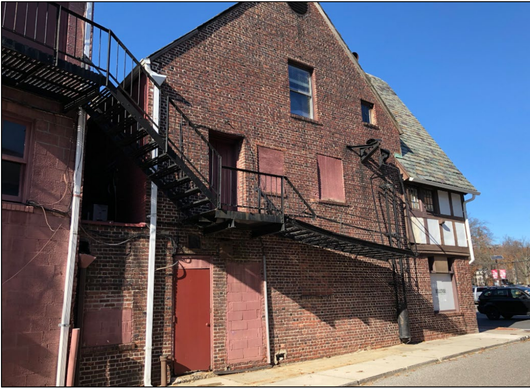
Figure 4: A view of the eastern facade of the theater, November 2019.

Township of Montclair, Essex County, New Jersey