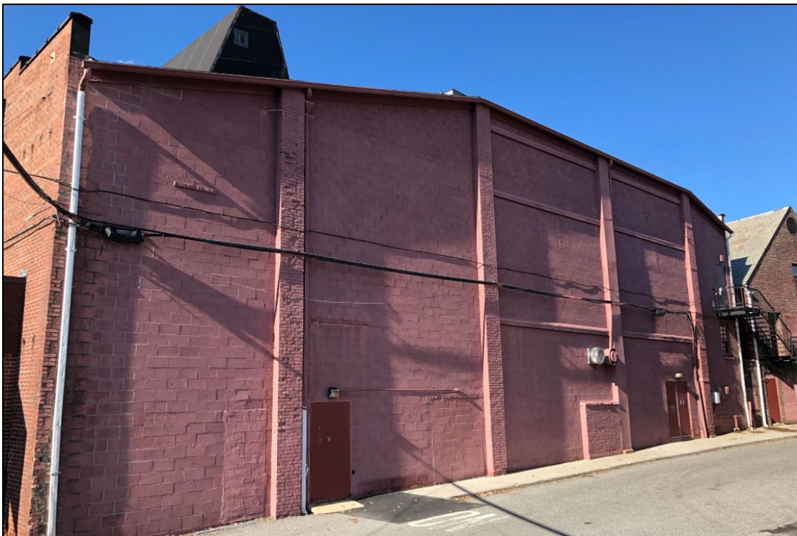
Figure 5: View of east façade of subject property adjacent to driveway.