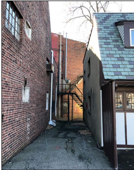
Figure 6: View of alley on west side of subject property.

Township of Montclair, Essex County, New Jersey