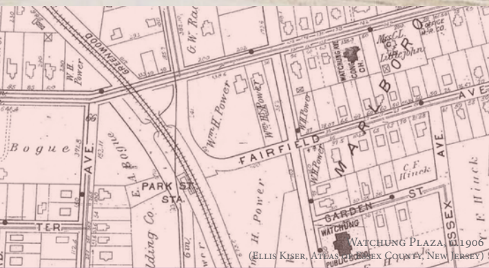
WATCHUNG PLAZA, C.1906 (ELLIS KISER, ATLAS OF ESSEX COUNTY, NEW JERSEY)