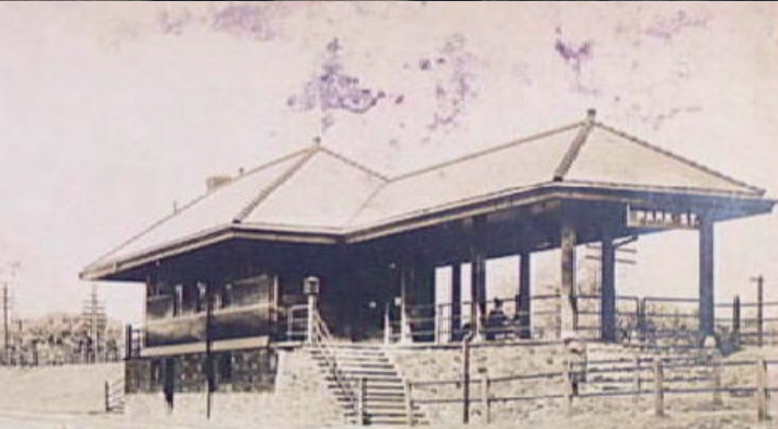
WATCHUNG STATION, C.1910