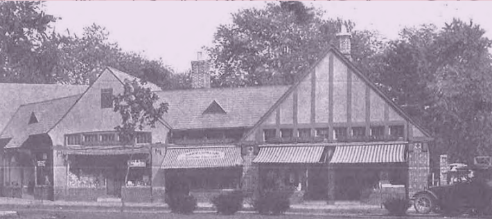
PARK STREET PLAZA, C.1918 (MONTCLAIR TIMES, 15 JUNE 1918)